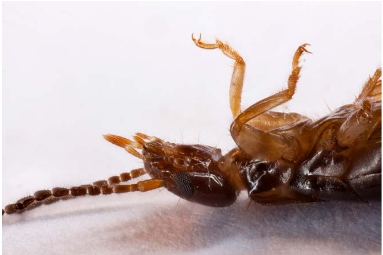
Here's the compacted stack of the 191 photographs. Notice the tentacle overlap on the far left.