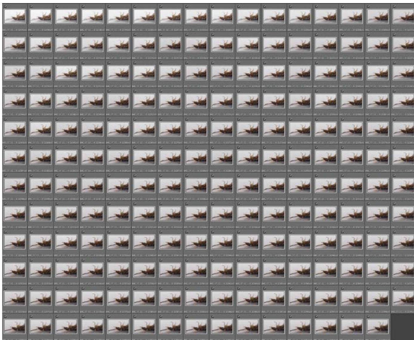
A total of 191 separate focus modifications.