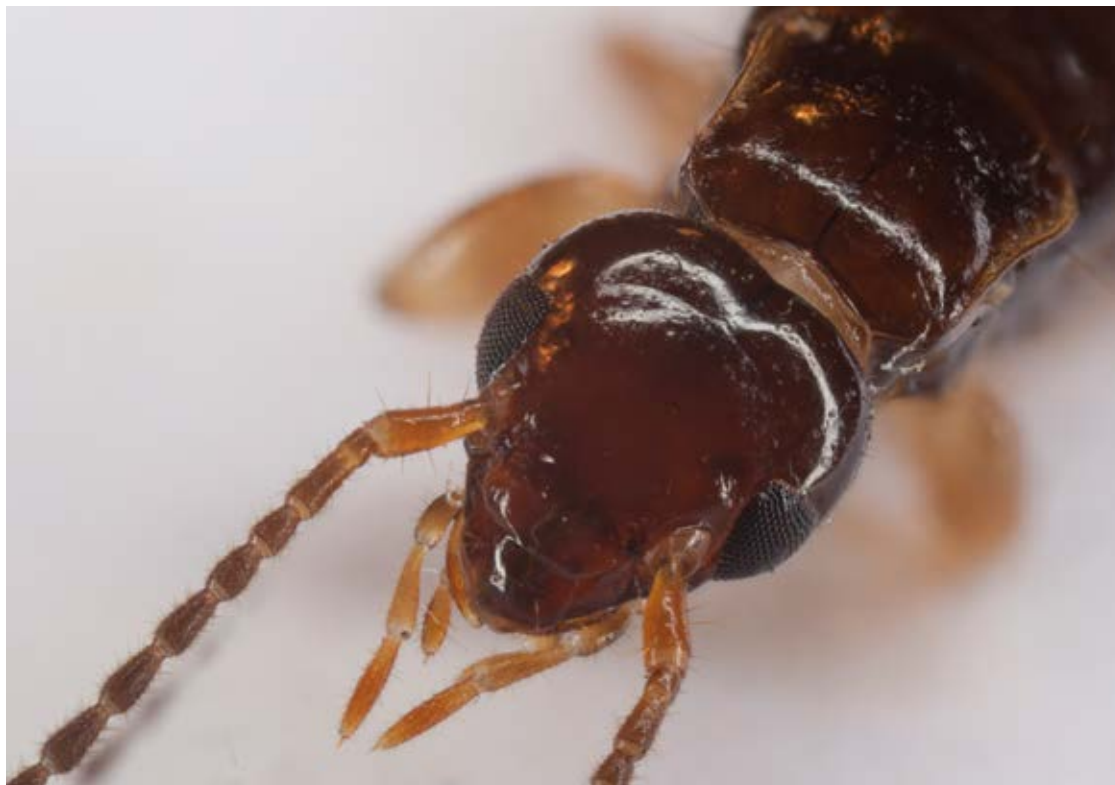
Another photograph of the same insect with a total of 128 photographs. This photograph was straight from Helicon Focus' compaction of unaltered RAW photographs (no post process cleanup, unlike above).