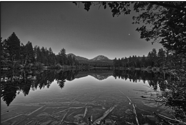
Aurora HDR 2018

With Aurora HDR 2018, the bottom of the photo with details of the lake are much improved over the Lightroom HDR photo. The problem, the majority of the photograph in Aurora HDR 2018 stinks (too many problems to list), so Lightroom