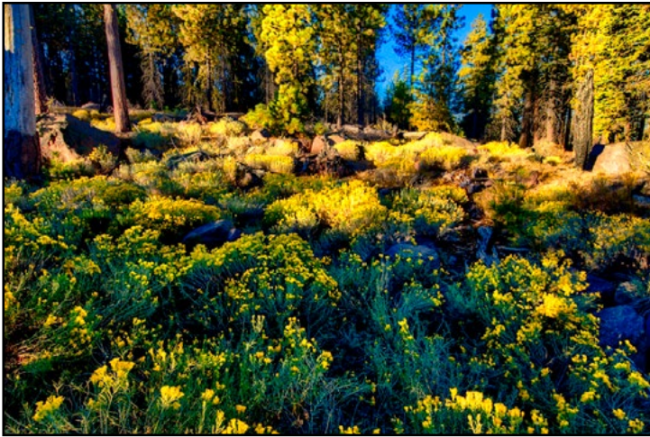
Aurora HDR 2018