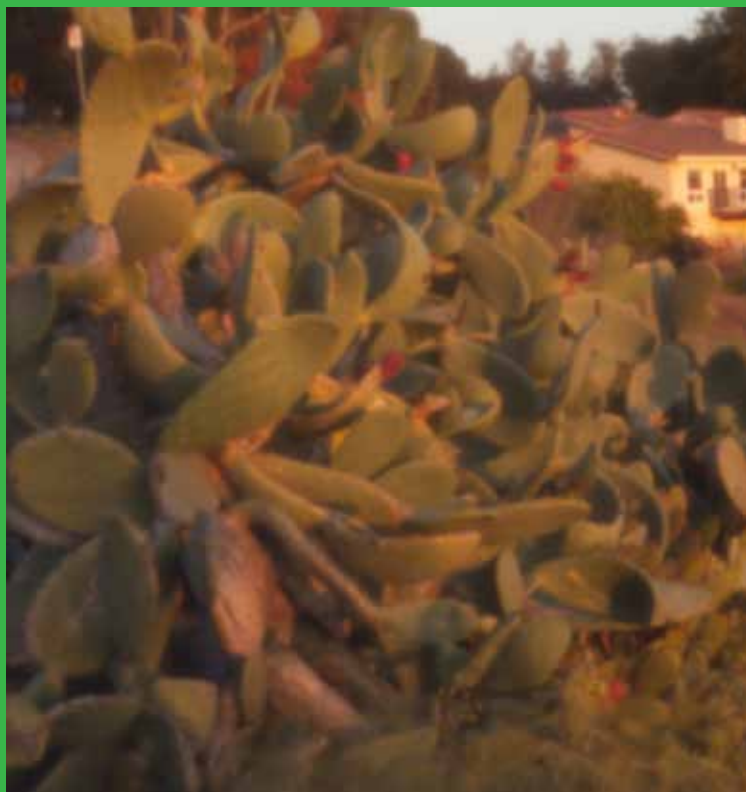
Pinhole Camera photo: cactus before first u-turn on E. Dunne Ave.

Create photographs that fit the theme and upload up to five of them to the club's Monthly Photo Themes flickr® group. If you are not a member of the Monthly Photo Themes flickr® group learn how to join here.