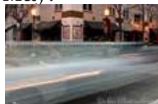
Rear Curtain Flash