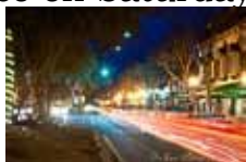
Tail Light Trails